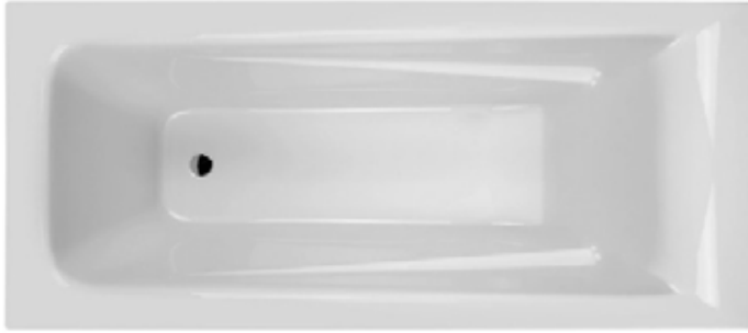
Decina Novara bath