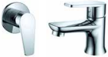
Eura basin, bath/shower mixer