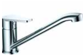
Argent Eura sink mixer