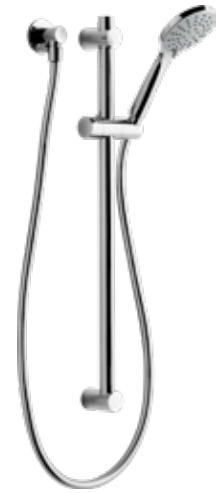
Argent Metro shower rail