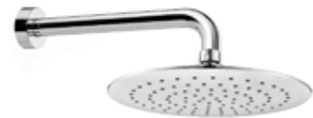
Argent Pallas overhead and Essentials arm