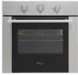
Euro 600mm electric oven