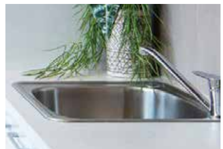
Laundry inset trough