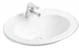
Argent Azure basin