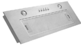
Euro 900mm undermount rangehood