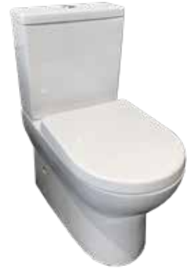
Argent Pace toilet suite