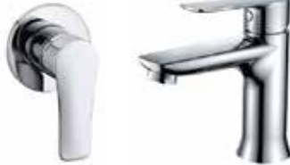
Axa basin, bath/shower mixer