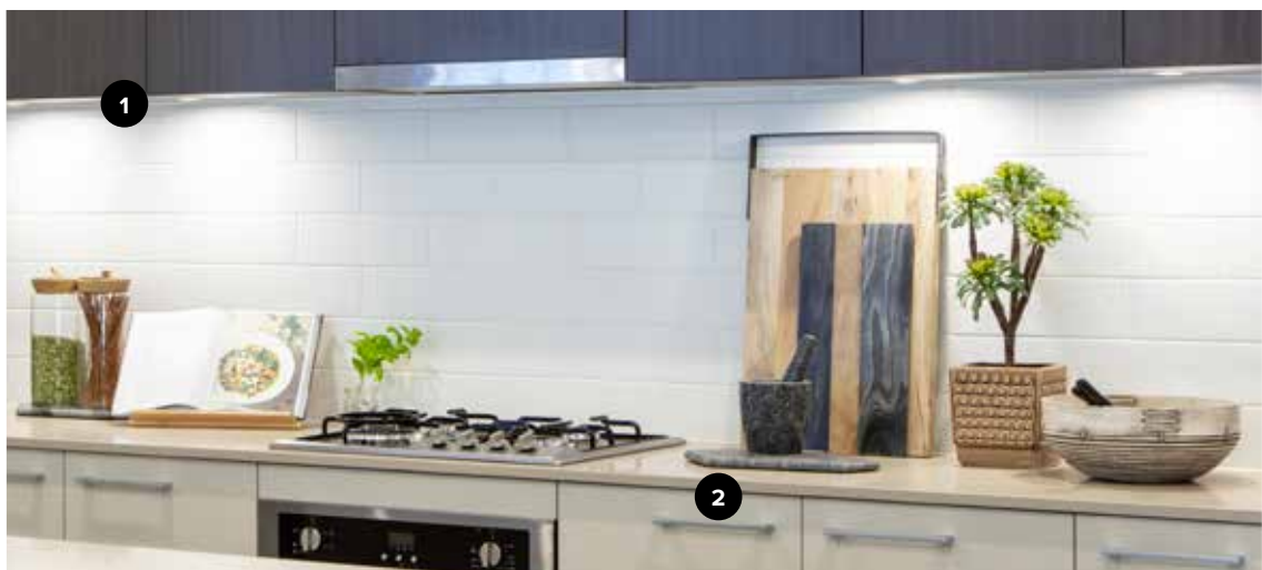
1. Overhead cupboards up to 2.2lm and 2. 20mm stone kitchen benchtops up to 5.4lm.