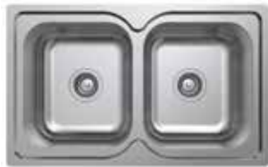
Format Double Bowl stainless steel sink