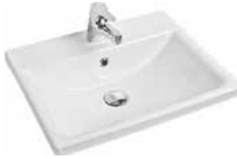
Argent Zen basin