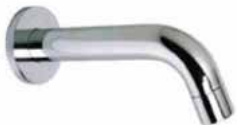
Argent Curve bath spout