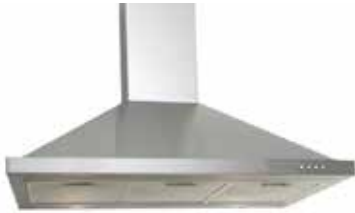
Euro 900mm canopy rangehood