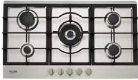
Euro 900mm gas cooktop