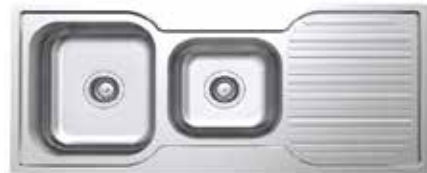
Format Main stainless steel sink