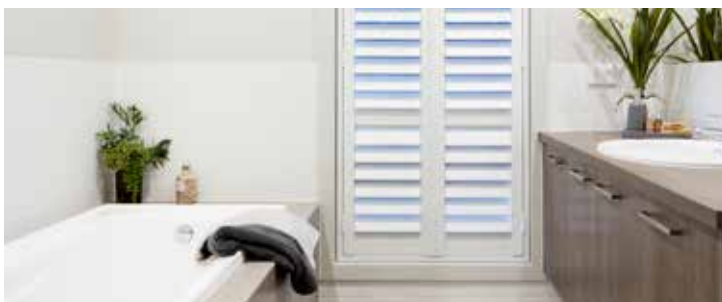
1200mm high tiling