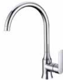
Argent Axa sink mixer